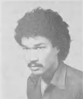
Edwin Young Technical